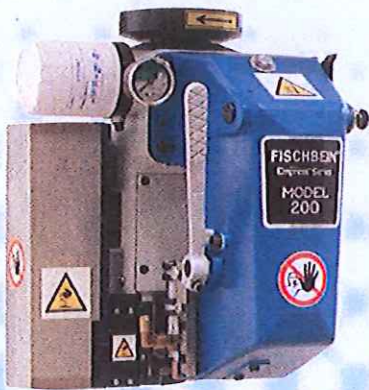
Head 200 with rotary knife