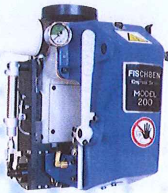
Head 200 with rotary knife (detail)